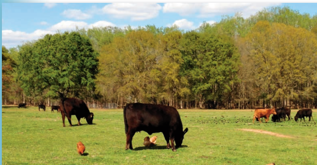
Free ranging benefits the livestock and the environment at White Oak Pastures.